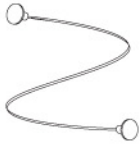
Cable and Saucer